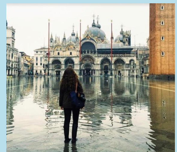
Piazza San Marco, Venezia

"The Wellesley College Winter Session in Rome provided a wonderful opportunity to study both Italian language and culture in Italy.