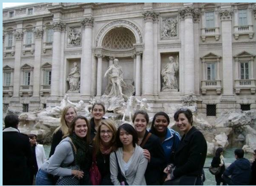
Studentesse alla Fontana di Trevi Prerequisites and Credits