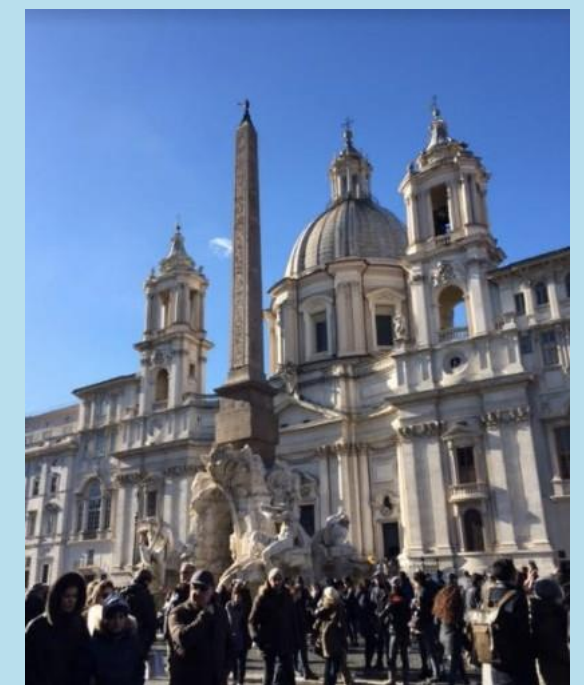
Piazza Navona, Roma

"Winter session in Rome gave me wonderful opportunities to experience Italian culture everyday both in and out of class. It also opened a whole new world to possible opportunities both at Wellesley and beyond in terms of sparking an interest in what I would like to consider after completing my education at Wellesley. It was not difficult to fall in love with Rome with its incredible places and warm people ready to welcome you!"