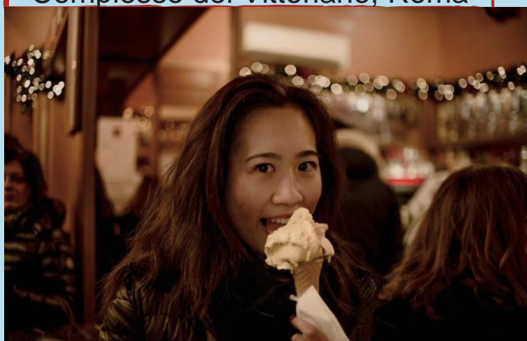
Un gelato da Giolitti