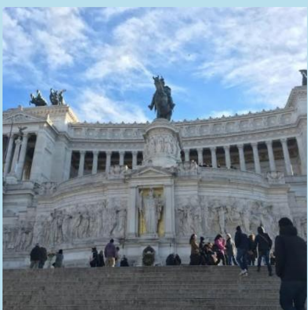
Complesso del Vittoriano, Roma