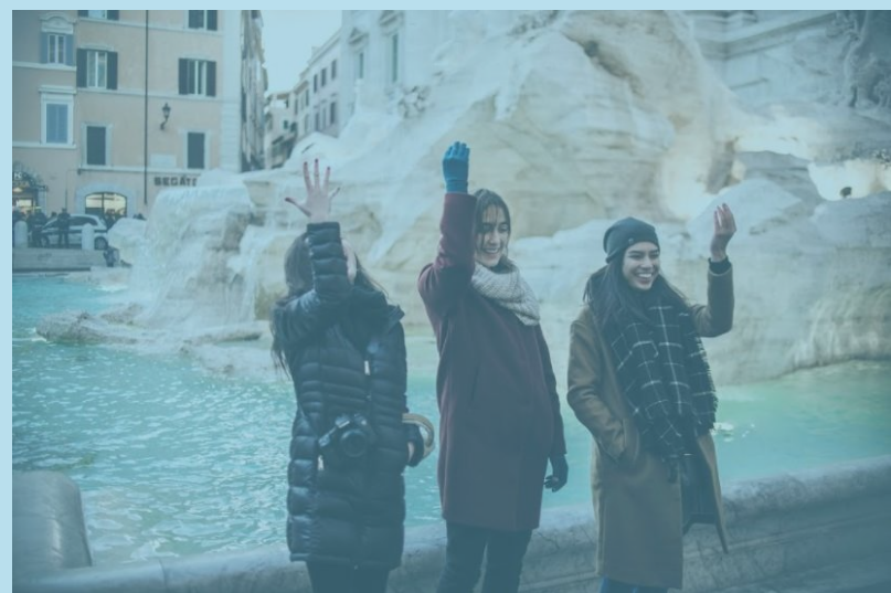
Fontana di Trevi, Roma

This intensive three-week course is a full immersion experience in Italy. It consists of grammar review, the reading of books and newspapers, discussions on current events, and compositions on cultural topics. The course includes a rich program of guest speakers and film screenings. Students also explore the historical and artistic sites of the city, and work on a final thematic project.